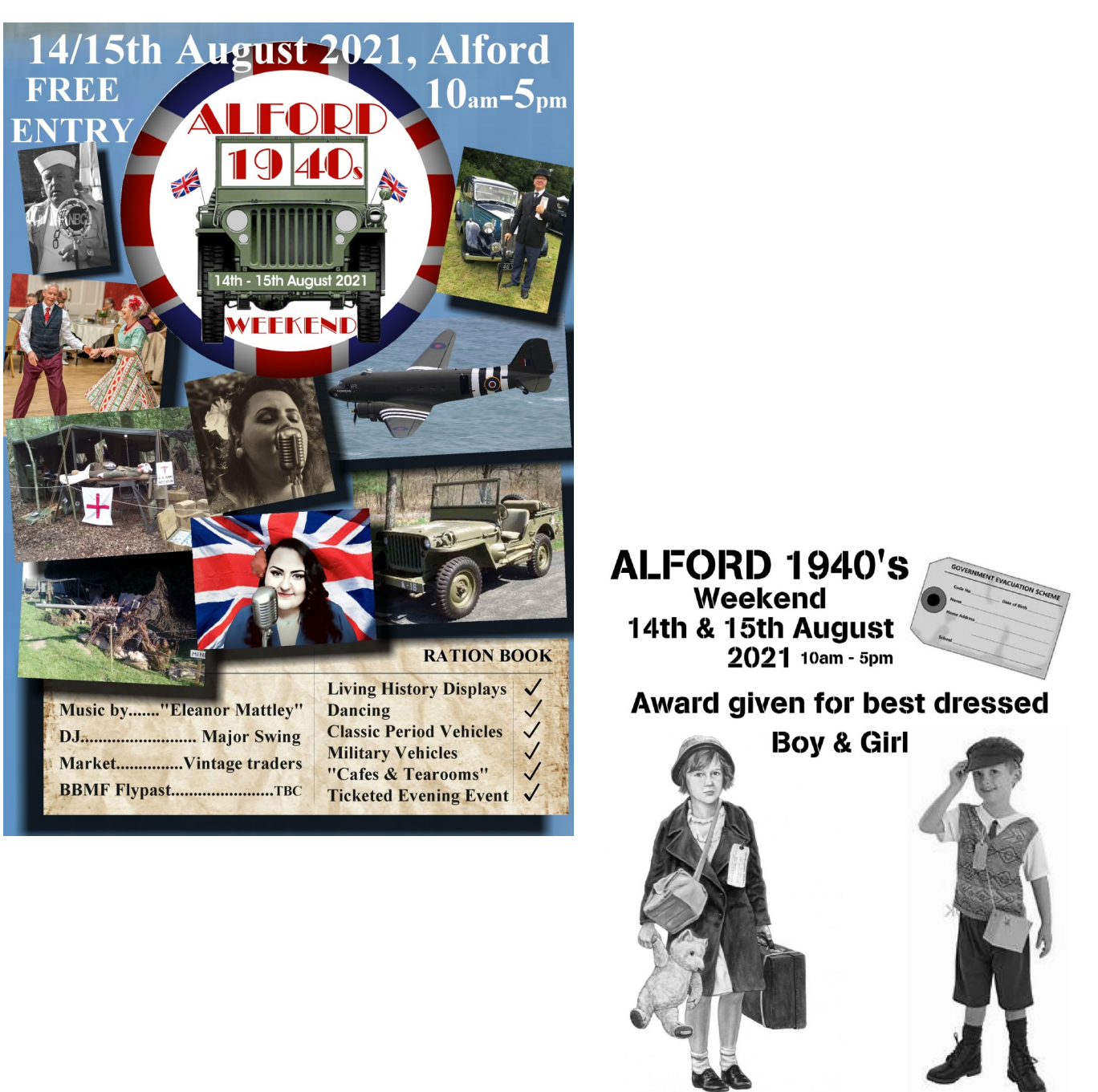
Examples of WW2 evacuees

* Live Music, * Army & Civilian Vehicles, * Vintage Market, * Movie Poster Trail Competition, * Living History/Army Displays * RAF Flypast